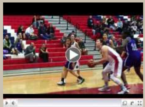
Sahuaro Winter Sports Review